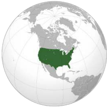
Seattle, Washington United States North America